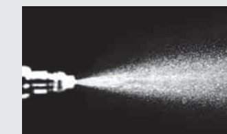
Injector pattern after P.I. treatment